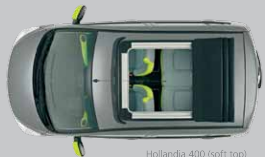
Hollandia 400 (soft top)

For example, the Hyundai i10 is exciting with its Hollandia 300 and Hollandia 400, as is the VW Fox with the Hollandia 400. Webasto is also setting new standards in the compact car segment in this regard.